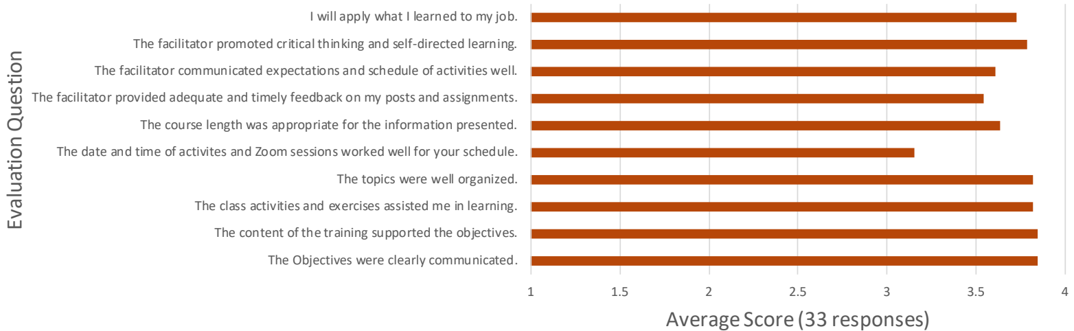
The Art of Coaching COpilot Class Evaluation Data

How do you feel about professional learning from CEA after taking this class?